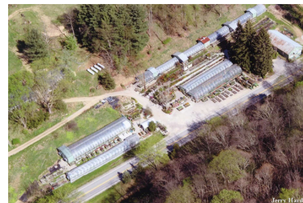
An aerial view of our greenhouses and gift shop.

By combining the seasonal greenhouse with a farm gift shop, we were able to create a reliable year-round business.